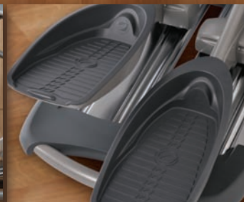
CLOSE PEDAL SPACING